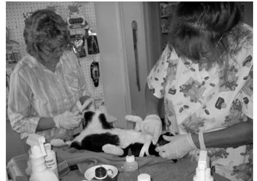
Volunteers ear-cleaning and flea-combing the cats