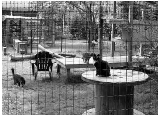
Well-cared for feral cats of Nicole Schoepflin

yard or garden are safe for animals. In addition to caring for their lawns, many people spend considerable time on their gardens and can become frustrated with cats that are digging in their gardens. An easy solution is to sprinkle the soil in the area with a substance to repel cats, such as citrus peels or sprays, cayenne pepper, coffee grounds, lemongrass, citronella, eucalyptus, mustard, vinegar, or commercial repellants (available at pet supply stores) specifically designed for this problem. Placing rocks on exposed