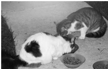
Murphy & friend