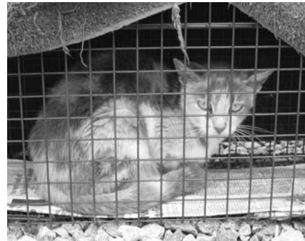
Cat at Feral Angel Spay/Neuter Clinic