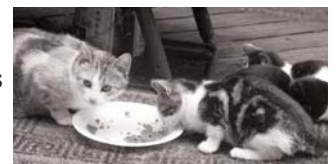
Feral mama and kittens

Although there is a very short time during cold weather months where cats are not mating, this reprieve from reproduction does not last long. Caretakers should continue to spay/neuter cats throughout the year, rather than take the chance of waiting too long and ending up with feral kittens to care for.