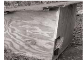
A basic wooden shelter

Use plastic storage tubs with the tops taped on. Place upside down with the lid facing the ground for extra stability, and cut a hole at end of one of the sides for cats to enter.